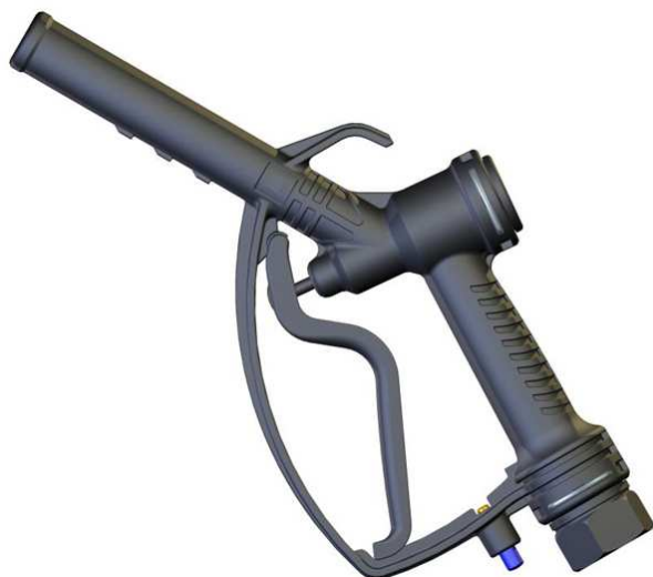
PMP120 N Pistola Plastica Nera Travaso gasolio/acqua Guarnizioni in NBR Interni in PP+FV+Acciaio Zincato